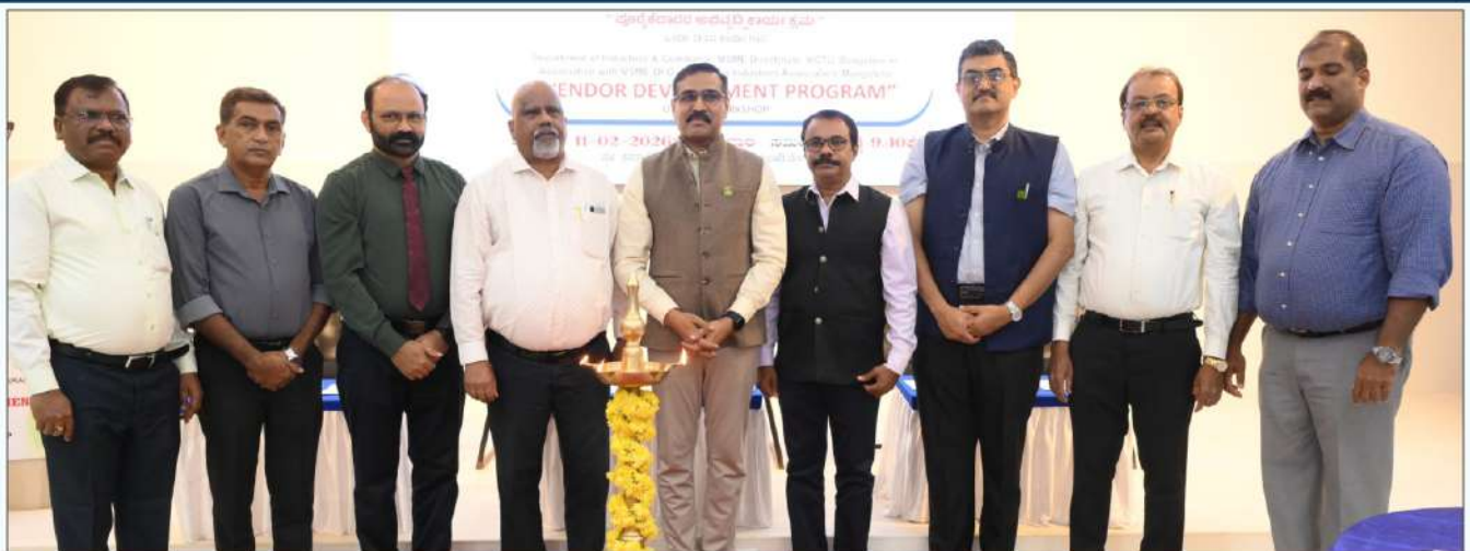
Kanara Industries Association (KIA) organized a one-day Vendor Development Program (VDP) workshop for MSME's under the RAMP Scheme on 11th February 2026.