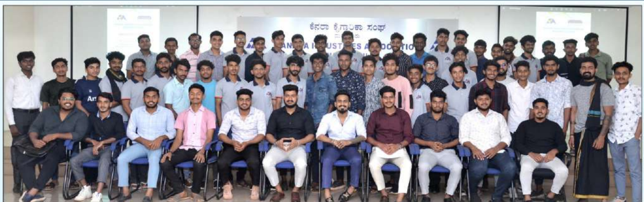
Kanara Industries Association (KIA) has been selected as one of the three Industrial Clusters (IC) in Karnataka under the STRIVE (Skills Strengthening for Industrial Value Enhancement) project funded by the World Bank. Under this initiative, KIA-IC will train apprentices and facilitate the placement of youth in various industries across Dakshina Kannada. More than 80 industries under KIA-IC have extended their support to place apprentices in their establishments. So far, 350 apprentices have already been placed in different establishments in the Baikampady Industrial Area.