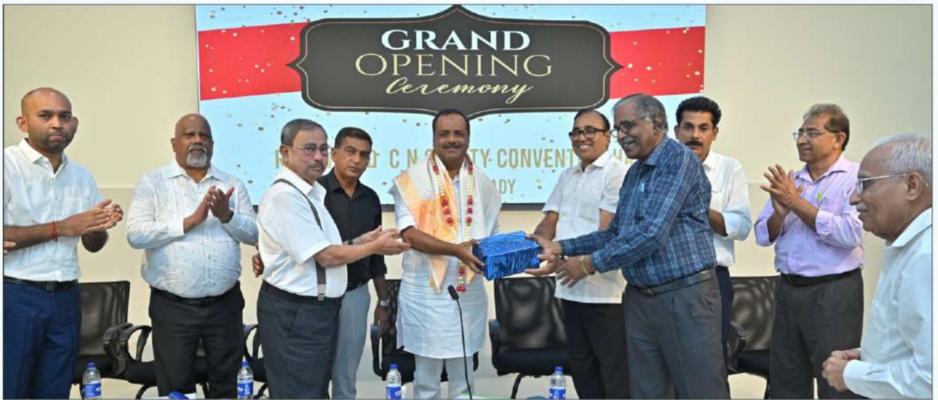
Inauguration ceremony of renovated C. N. Shetty Convention Hall, which was graciously inaugurated by Sri U. T. Khader, Hon'ble Speaker of the Karnataka Legislative Assembly